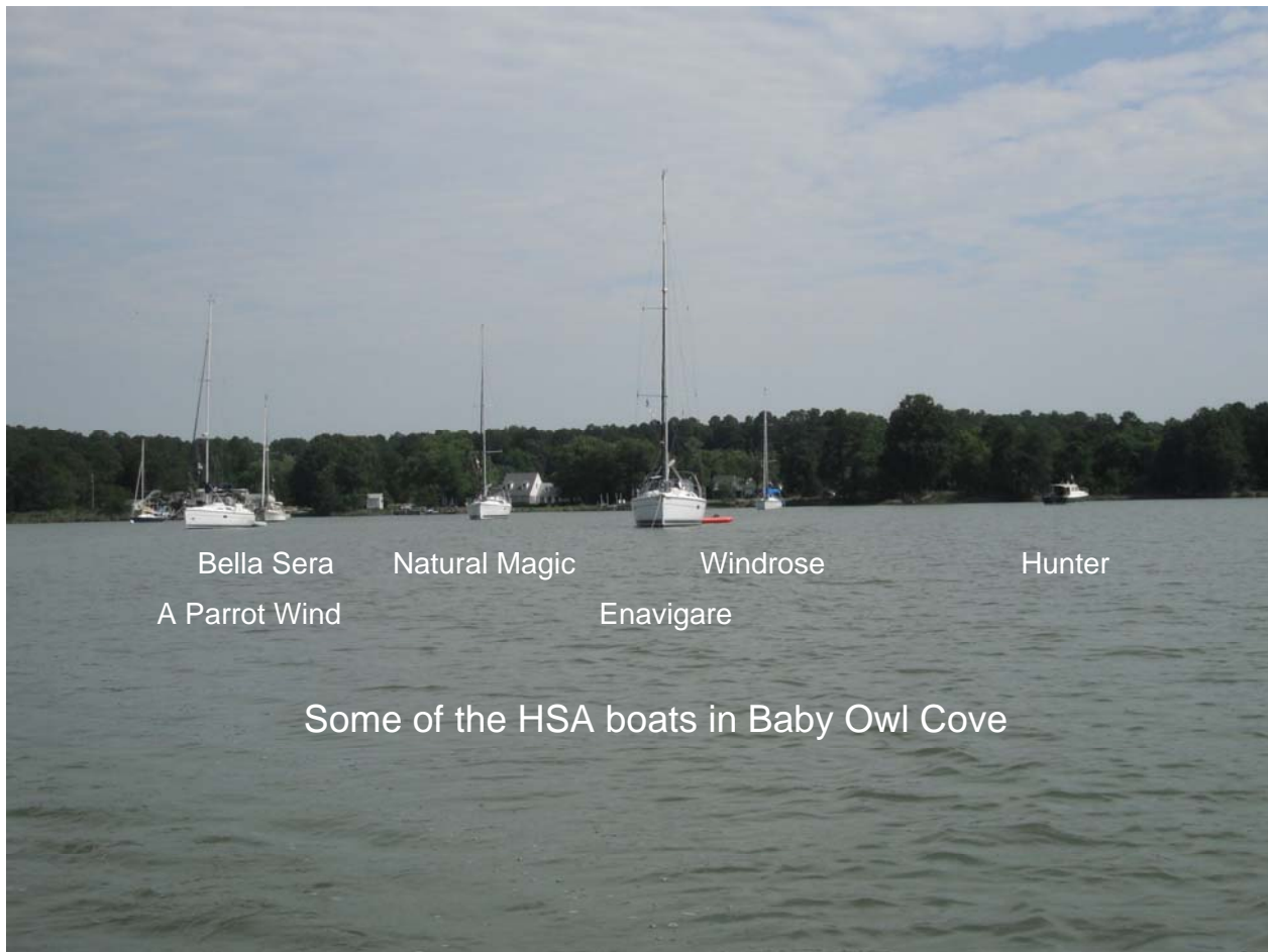
Some of the HSA boats in Baby Owl Cove