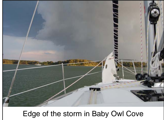
Edge of the storm in Baby Owl Cove

Fifty knots! We have to begin the wrap-up of the night sail with the story of the big blow on Friday evening. The forecast was 5 to 10 knot southerly breezes with possible showers and thundershowers. NOAA was right. The light air from the south was so light that Hoosier Lady , Windrose and A Parrot Wind all motored north from the Patuxent, arrived at our prescribed meeting place quite early and opted to continue to Baby Owl Cove rather than hang out for hours at the Choptank 7. Early on, Enavigare and Jibberish coming down from the Severn had a nice point of sail and went fast when the wind kicked up to around twenty knots on the edge of a shower.