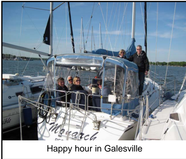
Happy hour in Galesville

HSA's Spring Forward raft-up on the West River April 30 th had a very nice turnout. It was a land/sea event with seven HSA boats sailing up the West River and 28 of us gathering for dinner! Enavigare , Second Life , and Four Seasons enjoyed the facilities of the Pirates' Cove slips. Monarch , Mission Impossible , Carried Away and Mood Swings anchored or rafted up in the River and shared post-happy hour dinghy rides into Galesville for a fun dinner at Pirates' Cove with those who came by car. The group going to Croatia met after dinner to progress their trip plans.