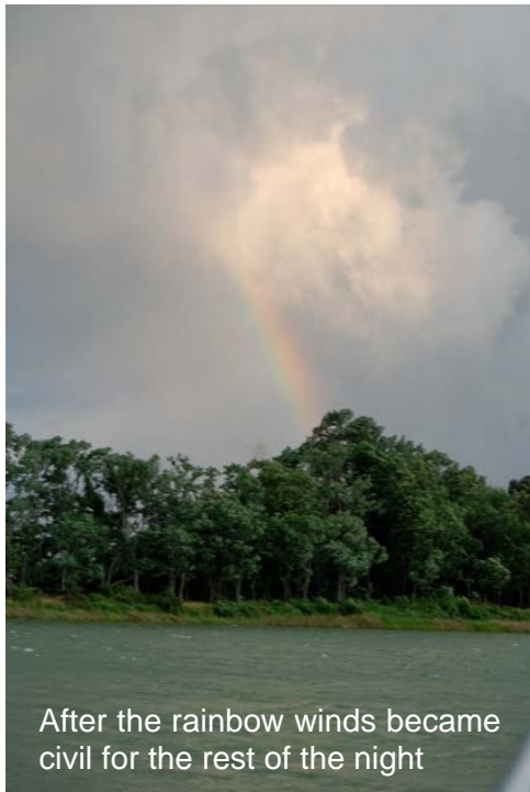
After the rainbow winds became civil for the rest of the night

Around 7 pm NOAA's forecast for T-storms came true. A big one came through with winds in excess of fifty knots. It really slammed Enavigare and Jibberish on the open Bay. Hoosier Lady and Windrose's guest Bella Sera were already anchored in Baby Owl Cove. Windrose , A Parrot Wind and Natural Magic were underway in Broad Creek only a mile or two from the anchorage. Even in a protected creek, the impact of fifty-knot winds is astounding. With winds like that around it was prudent for each boat to anchor separately rather than raft up. The storm ended with a rainbow.