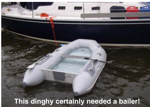
This dinghy certainly needed a bailer!