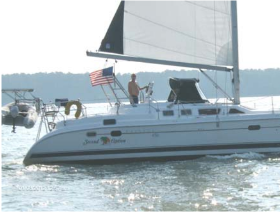
Second Option and Zum Wohl underway to Solomons and Deale on Memorial Day