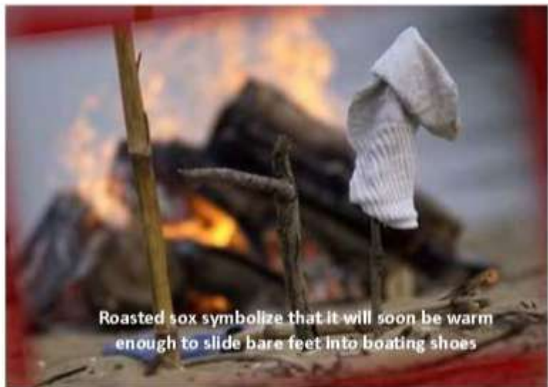
Roasted sox symbolize that it will soon be warm enough to slide bare feet into boating shoes