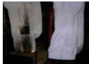
Avoid Nomex—it really doesn't burn well

...But the teenager said he did not think of the spilled petrol when he lit his socks, which he had done many times before without apparent damage. "He explained that he uses black 'business' socks for this," the judge said. "He said that the sock has 'a little mini flame' and 'it looks mean how it runs across the sock'. The boy's mother confirmed his sock-lighting habit and said she had never seen any damage to the socks or anything else until the garage fire.