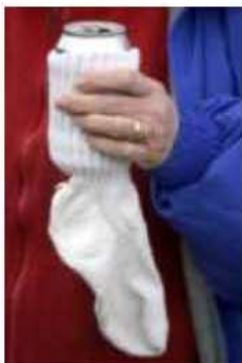
Make Beer Cozies