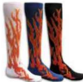
Wear (burn?) your favorite apparel