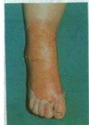
Remember to remove your socks first.