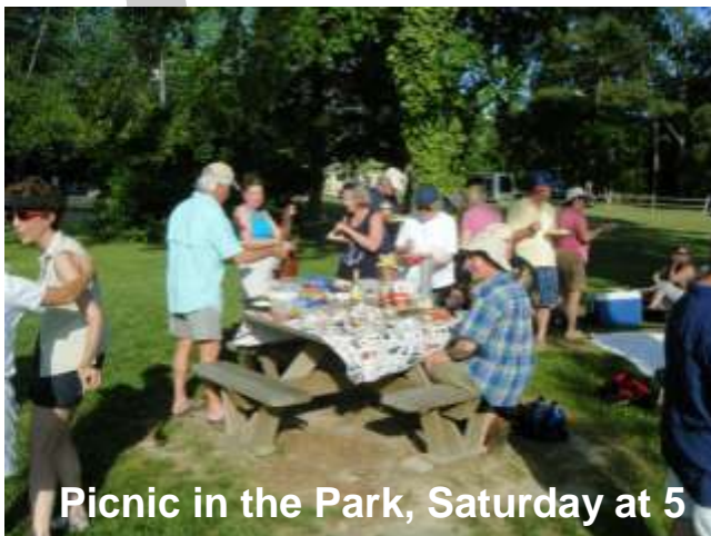
Picnic in the Park, Saturday at 5

Approach via Choptank River, Broad Creek and then San Domingo Creek