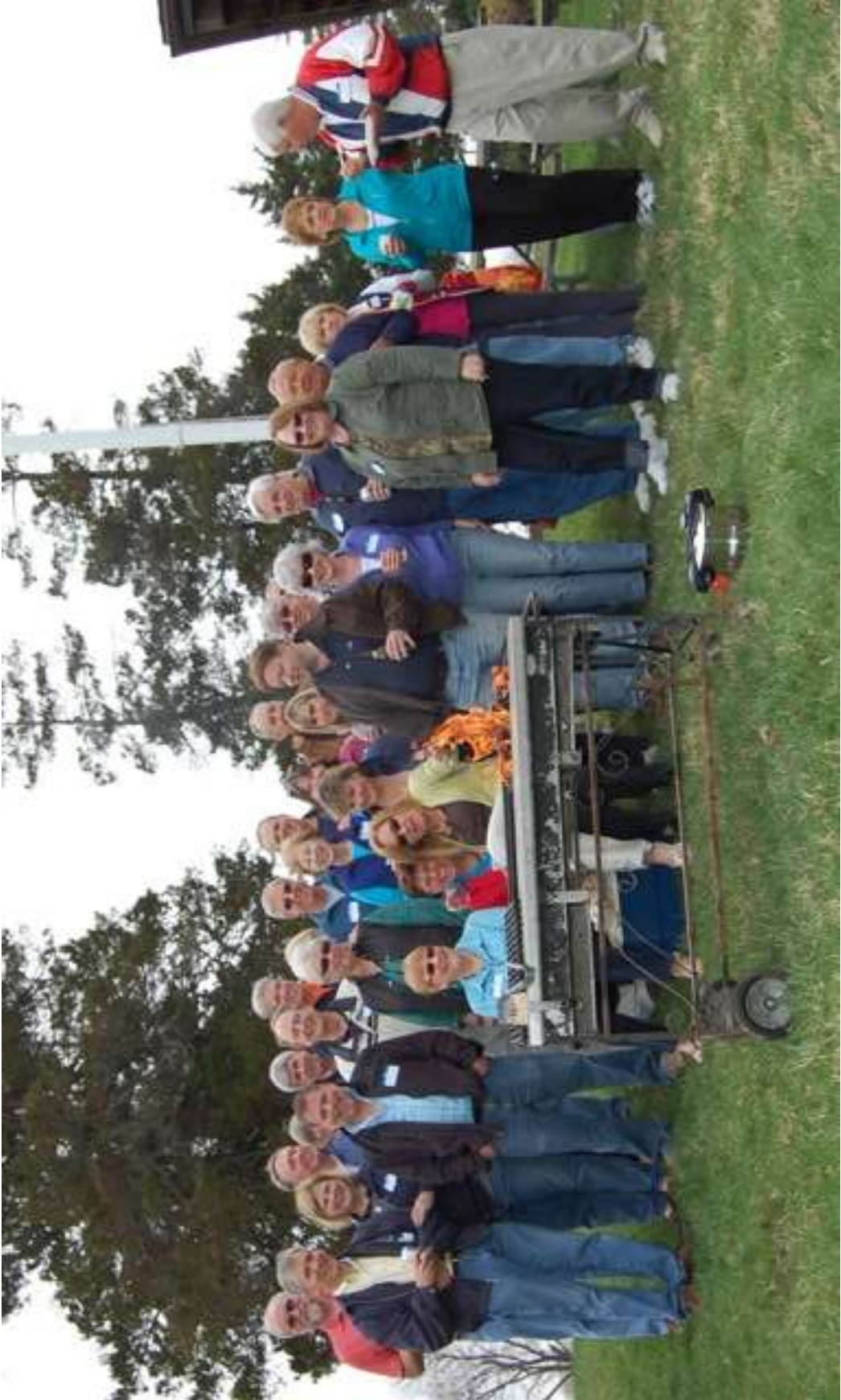
There were even more members than this at the Shipwreck Party- some were camera shy, some were late.