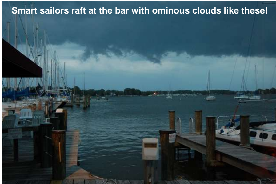
Smart sailors raft at the bar with ominous clouds like these!