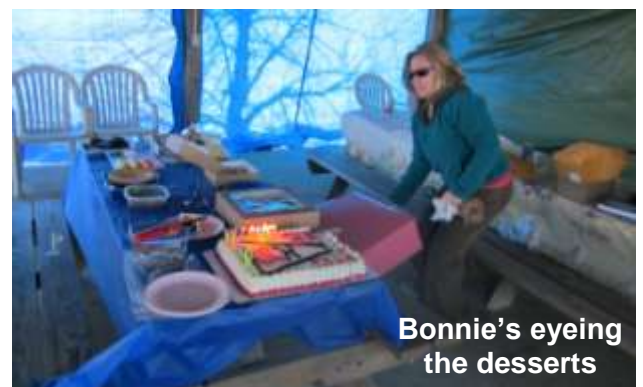
Bonnie's eyeing the desserts