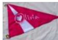
Olivia Constant Foundation's burgee

We will be honoring this young sailor who lost her life last year on the Severn in a tragic sailing accident last June by passing the hat, doing a 50/50 raffle and perhaps a scavenger hunt with an "admission" fee and prizes...details to follow