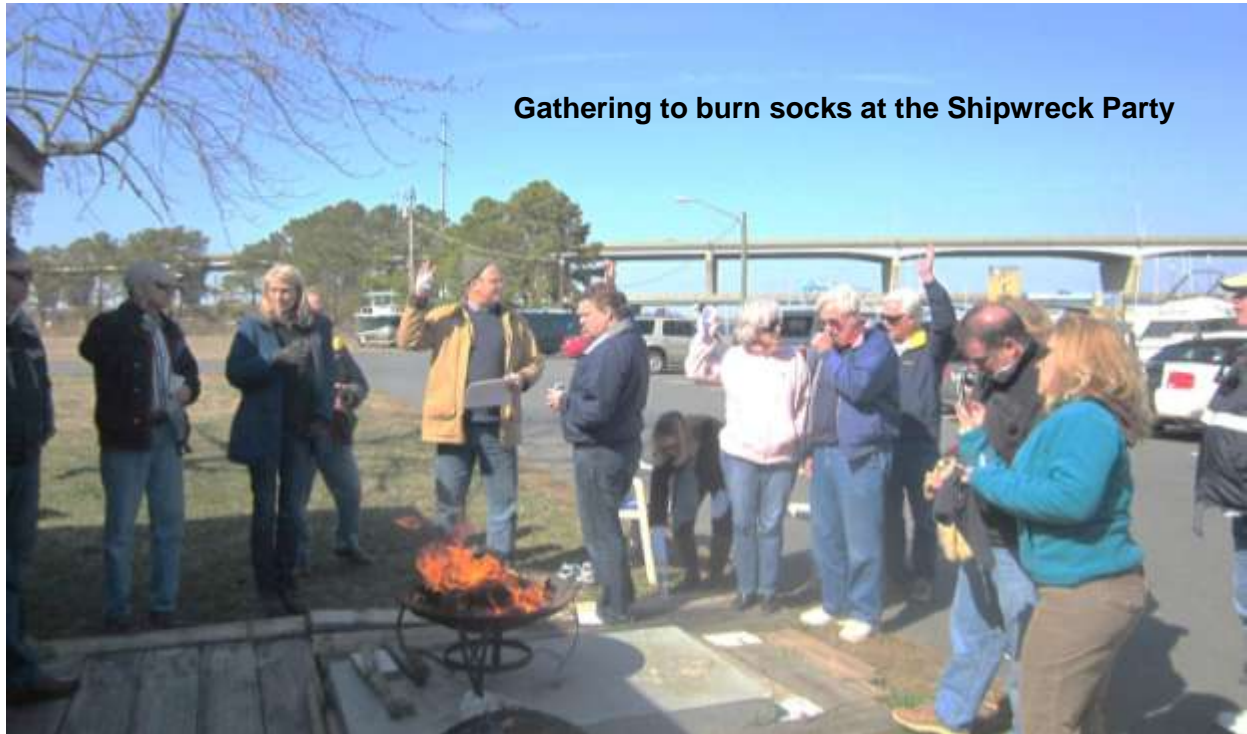
Gathering to burn socks at the Shipwreck Party