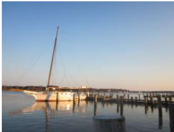
Built in 1901 at Hudson, MD the skipjack Elsworth today sails out of Chestertown, MD

Saturday and Sunday there are Seminars for you to attend and there are always fun kid's activities to entertain the little ones.