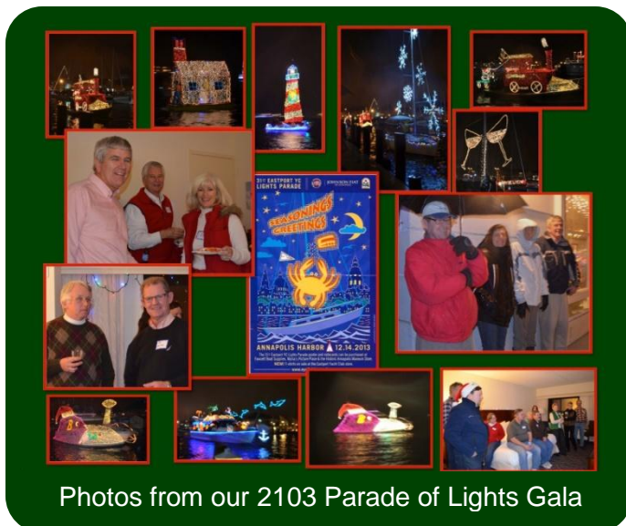
Photos from our 2103 Parade of Lights Gala

As always, we wrap up our year with the Annapolis in-water Parade of Lights. No we're not in the water, the spectacularly lighted boats are in the water while we party in our warm two-room suite and look out the window at the boats. Of course we are right there, so as you wish you can duck out and get up close and personal with the floats then come back in to warm friendship in the warm suite.