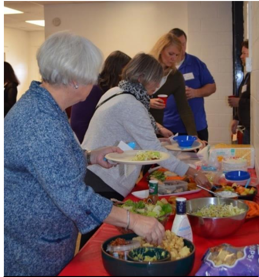
We feasted on club members' favorites.